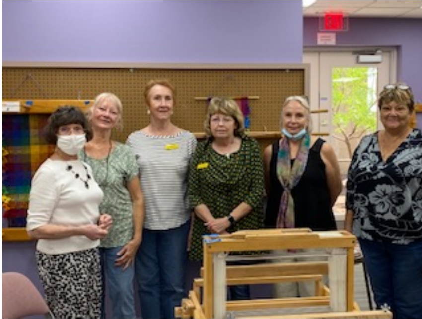
Graduating class and instructors of latest Weaving II class (April)