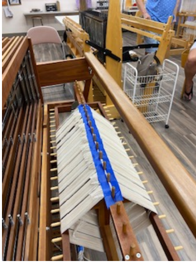
From here, you dress your loom.