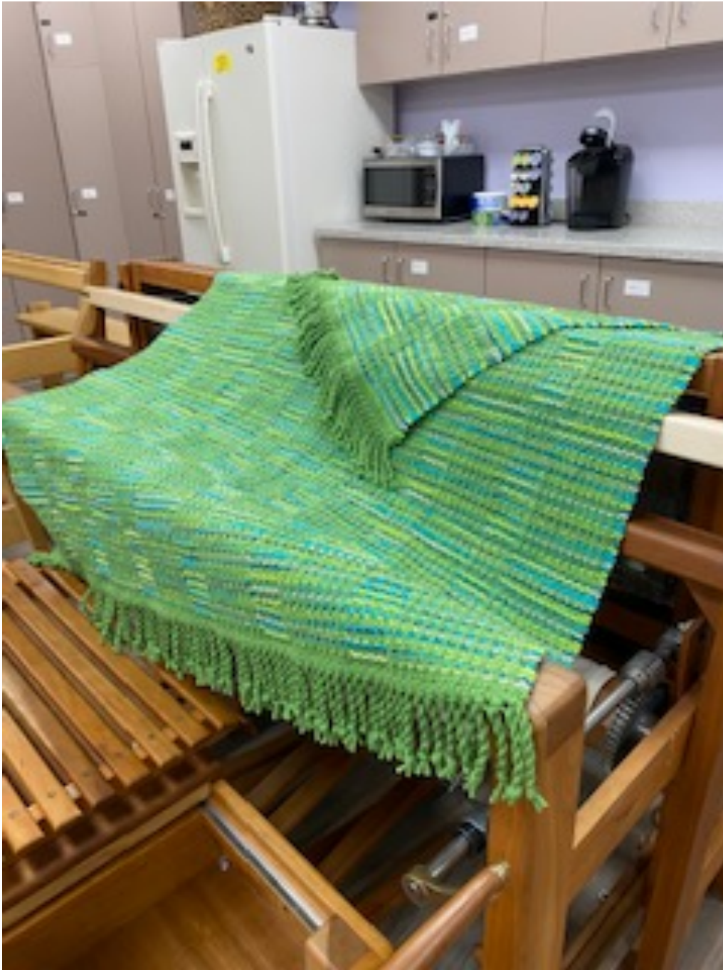
That isn't the only Linus project! Diane Conery created this beautiful green blanket for some lucky person.