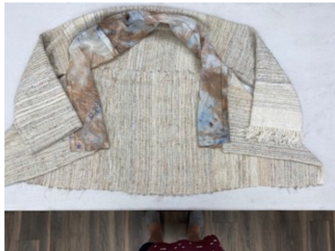
Carol Byrne created these beautiful jackets.