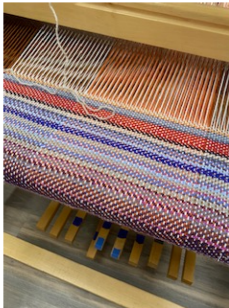
The start of the second blanket