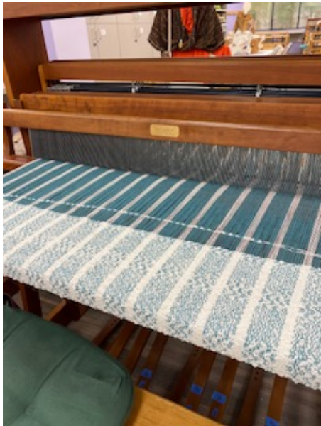
Towels by Lise Lavigne