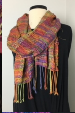
Wow!