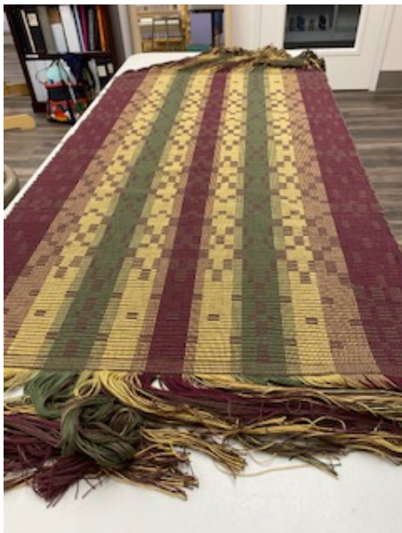
Rug/Wall hanging by Vickie Regnart