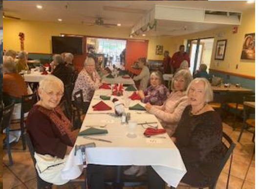
Lots Happening at Weavers West