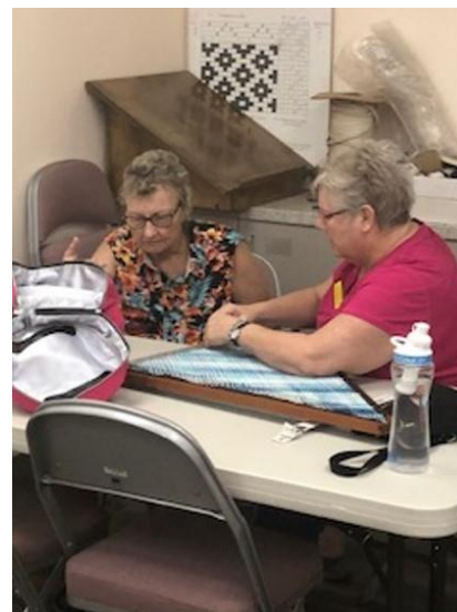
Photo of Previous Weaver's West Triangle Loom Class

Although either a floor or table top loom can be used for the class, it is highly recommended that a floor loom be used, so unless you are bringing your own floor loom, please be sure to sign out a WWG floor loom for January when you sign up for this class.