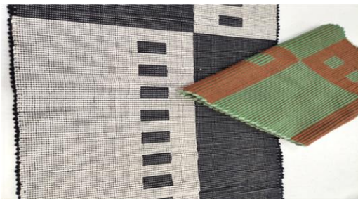
Vickie Regnant’s Rep Weave Table Runners