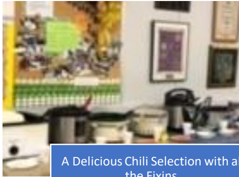
A Delicious Chili Selection with all the Fixins.