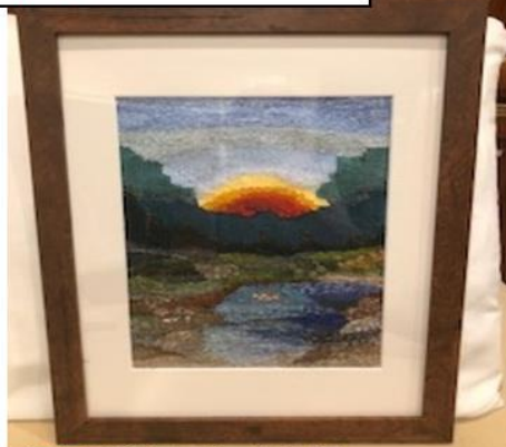
Dagmar Weissenborn's Completed Tapestry