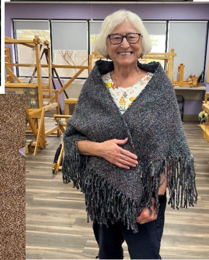
Above and to the Left: