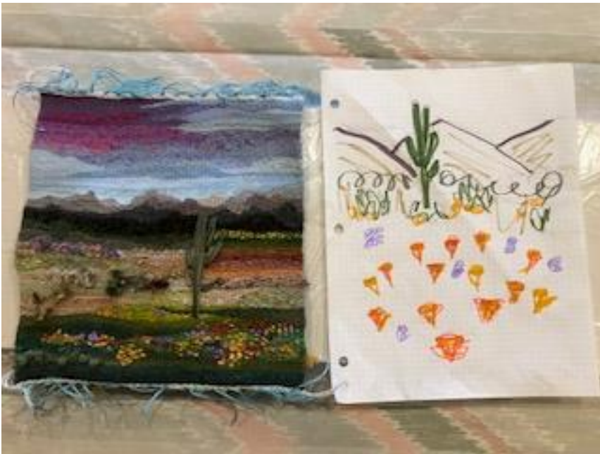
Dagmar Weissenborn's finished tapestry including the inspiration drawing.