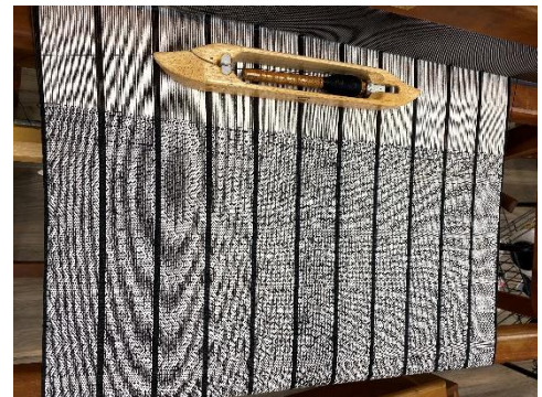
Zoom in on the photos to see the beautiful design.