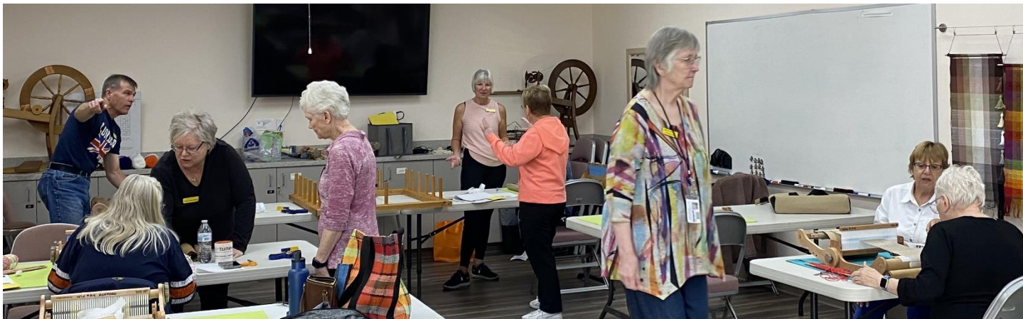
Above: Dedicated Instructors & Students—Weaving I working away on a SATURDAY!