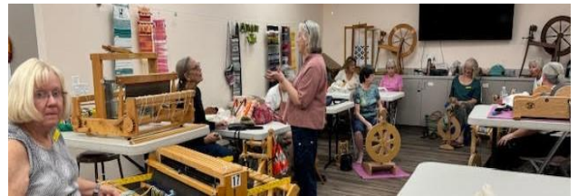
Spinners working away on a Tuesday afternoon.