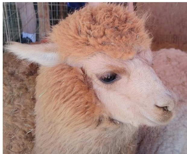
Above: Alpaca Mom