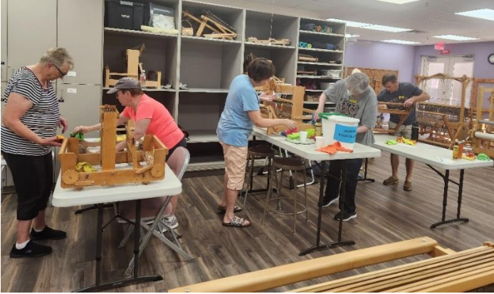
Above: Hard at work on some of the table looms.