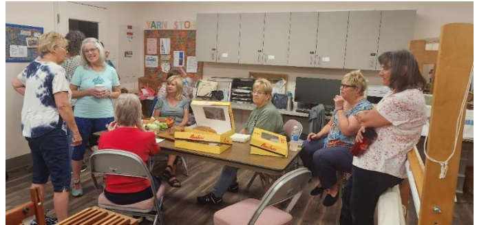
Above: Taking a break to visit.