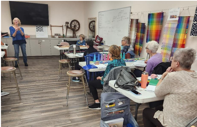
Above: Weaving III Classroom time.

"Tell me and I forget, teach me and I may remember, involve me and I learn."